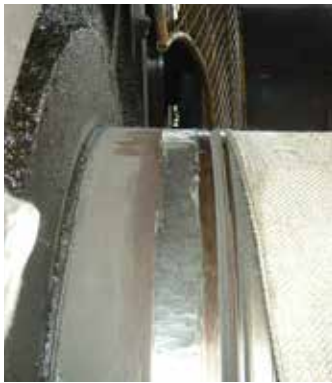
Worn seal area