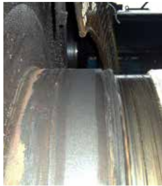
Seal area repaired